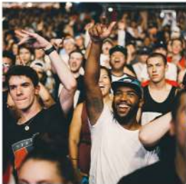
Festivals and Events