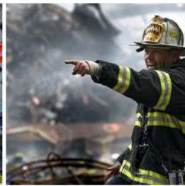
Emergency Situation Command