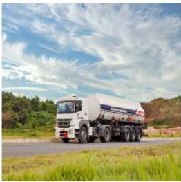
Transportation and Logistics

The fastest growing sector is service companies with small and medium-sized fleets .