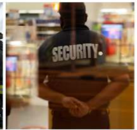
Safety and Security