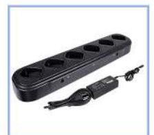
6 Way Charger